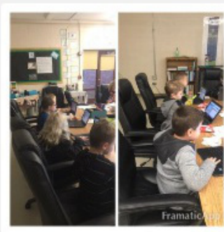
1st and 2nd Grade Chrome Squad