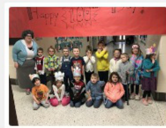
Kindergarten Turns 100 Years Old