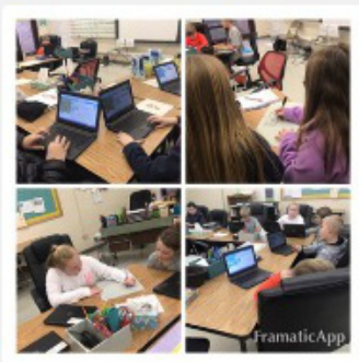
3rd, 4th, and 5th Grade Chrome Squad