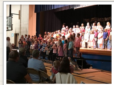
Second and Third Grade performing at the "Lights, Camera, Action" musical.