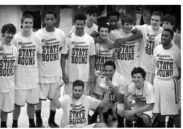
The Runnin' Hornets pose for a picture after their win against Unicoi County.

a high scoring point total of 110-103. The Runnin' Hornets made history becoming the first district champions since 1987! Following the district tournament came the